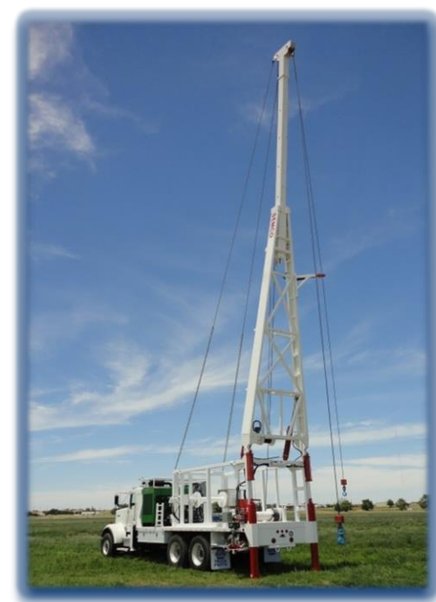
SEMCO S30,000 PUMP HOIST