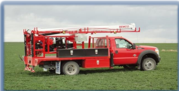
SEMCO S6,000 PUMP HOIST