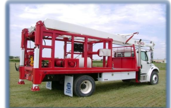
SEMCO S25,000 PUMP HOIST