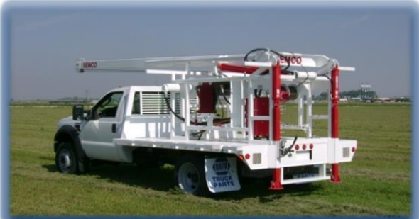
SEMCO S4,000 PUMP HOIST