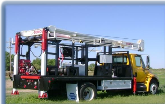
SEMCO S12,000 PUMP HOIST