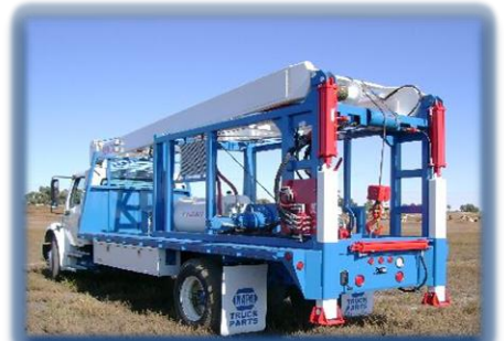
SEMCO S20,000 PUMP HOIST