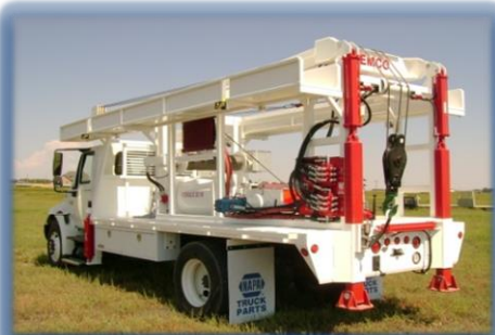
SEMCO S10,000 PUMP HOIST