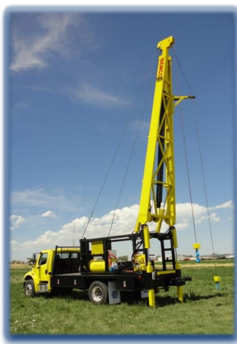
SEMCO S15,000 PUMP HOIST