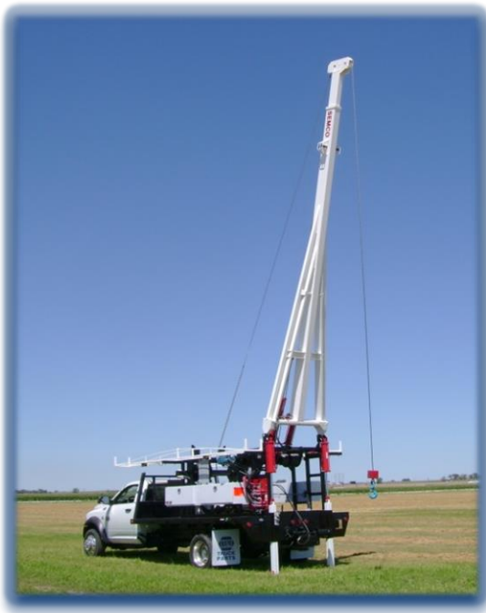
SEMCO S8,000 PUMP HOIST